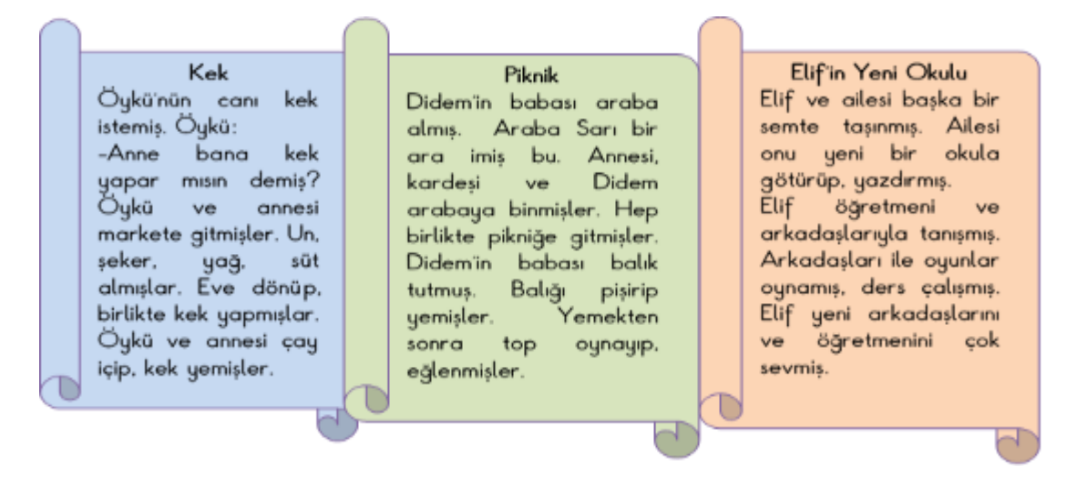
Figure 4. Texts of Reading and Writing

after completing the teaching of the sentences and realizing the analyses. New texts are formed with these sentences and the students read/write them. During the studies, while examining the meronymy; the teachers try to improve the children's vocabulary, to make them apprehend the structural features of the language and to solve the problems in reading and writing (Figure 4).