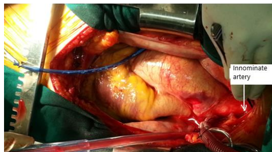
Figure 1: Arch cannulation

arrest, and axillary cannulation was performed in all these patients. In those patients with the extension of ascending aortic aneurysm to the proximal of innominate artery, where there is no space for both aortic clamp and cannulation, we performed arch cannulation and no circulatory arrest (Figure 1). The aortic clamp was placed below innominate artery and angled to cover part of the arch by the extent of the aneurysm.