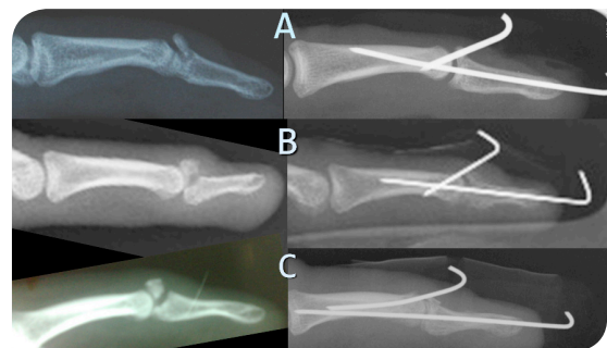
Figure 1-A: The average articular surface involvement was 30%.

Mean age of the pre-operative patients were 29,8 (range 18 to 42) and 29 of 36 patients (80,5 %) were male and 7 (19,5 %) were female. The 4th and 5th fingers were the most frequently involved finger 12 , followed by the 1st fingers 5 , the 2nd fingers 4 and the 3th fingers 3 . 27 patients had mallet injury in dominant hand, 9 patients had in non-dominant hand. Based on the Doyle classification, 25 injuries were classified type IVb, 11 injuries were classified type IVc (Figure 1).