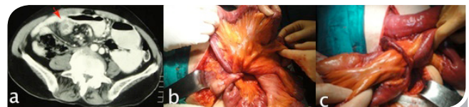
Figure 2: (a) Abdomen CT; a) It's the dilatation in proximal intestine segments and partial stricture on ileum level seen (arrow). No inflammation symptom or free fluid in the abdomen. Intraoperative appearance; b-c) It's the adhesion of long appendix to intestine mesentery depending on inflammation and its ileum segment comp-