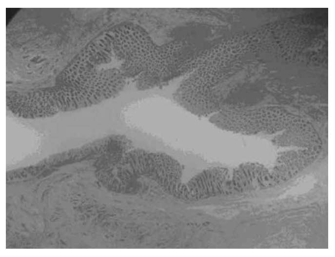
Figure 2: The histopathological view of the caecal diverticulitis

Solitary caecal diverticulitis is similar to other diverticulum with their presentations of inflammation, perforation or bleeding. It is informed that its diagnosis is similar to acute appendicitis with right iliac fossa pain, vomiting and occasional nausea.<sup>6</sup> Also, we observed similar diagnosis in our case.