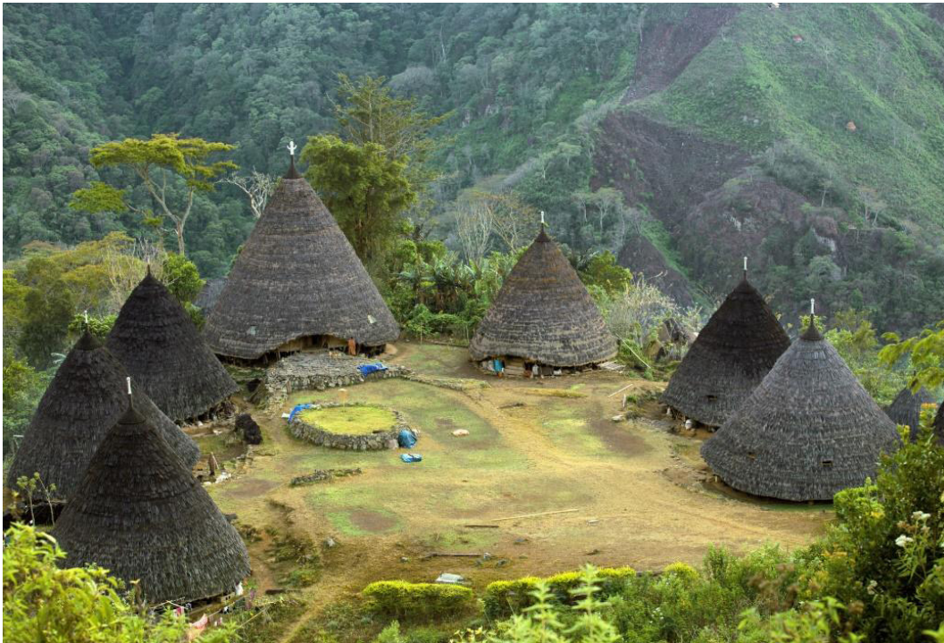
Figure 1. Mbaru Niang houses in Wae Rebo

Antar's success story in injecting tourism to the previously unexplored places attracted the Indonesian government to adopt a similar approach for their tourism strategies. With the aim to double the number of foreign visitors to 20 million by 2019 as a target set by the President (Pratama, 2017), The Ministry of Tourism invited Antar together with the Indonesian Agency for Creative Economy (BEKRAF), Indonesian Institute of Architects (IAI) and PT Propan Raya as a private sector to help to pursue the goal. Focusing on developing 10 new tourism destinations as the 'New Bali', they set up series of design competitions inviting Indonesian architects to contribute in designing various functions (i.e. cultural housings, tourism villages, homestay units, restaurants, airports, and souvenir centre) while emphasizing the influence of local architecture. With the name of 'Nusantaran Architecture Design Competitions' ( Sayembara Desain Arsitektur Nusantara ) and offering prizes of 1 billion Rupiahs (around