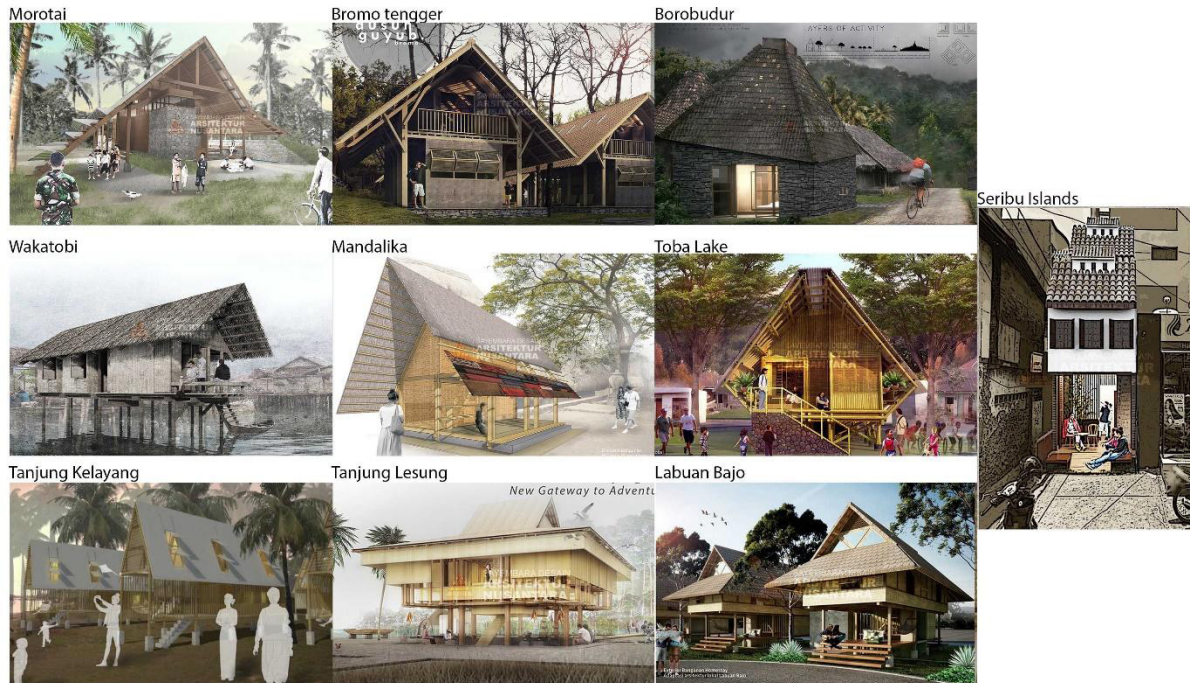
Figure 2. The winning designs of Nusantaran Architecture Design Competitions 2016 for Homestay category

USD 74,000) in total, the competition received an astounding enthusiasm from Indonesian architects, proven in hundreds of proposal submitted on each cycle. Even in its fourth cycle in 2016, there were 728 design proposals submitted to the competition and made the competition recorded in Indonesia World Records Museum ( Museum Rekor Indonesia—MURI ) as a design competition with most participants (Odin, 2016; Ramadhiani, 2016). From one side, this euphoria can be seen as a depiction of Indonesian people's eagerness to involve in delving their cultural identity and contributing to an effort to preserve it; but on the other side, one can also argue that the massive reaction was mostly triggered by the enormous prize offered and the enticing possible future projects.