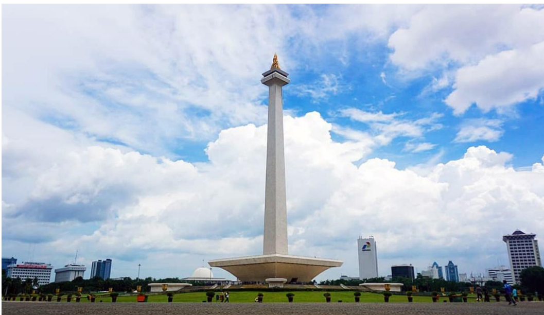
Figure 5. The National Monument in Jakarta, one of Sukarno's nation-building project

Furthermore, I suspect that the emergence of this Nusantara architecture has a strong political drive behind the claim of its cultural focus. In Indonesia academic constellation, there has been a concealed competition between universities in the West and the East of Java. Two universities in the West side of Java, Universitas Indonesia (UI) and Institut Teknologi Bandung (ITB) have been under the spotlight for a bit too long as two of the most prestigious state universities in Indonesia. Being close to the capital city of Indonesia, UI and ITB have been exposed to the rapid development of architecture, and it is reflected in the brisk contemporary discourse that dominates the direction of the schools. Meanwhile, in the East of Java, the emergence of Nusantara architecture discourse creates a platform on which the East Java-based universities, Institut Teknologi Surabaya (ITS) and Universitas Brawijaya (UB), can steal the national attention. This drift shifts public recognition from the West to the East of Java, especially after the massive