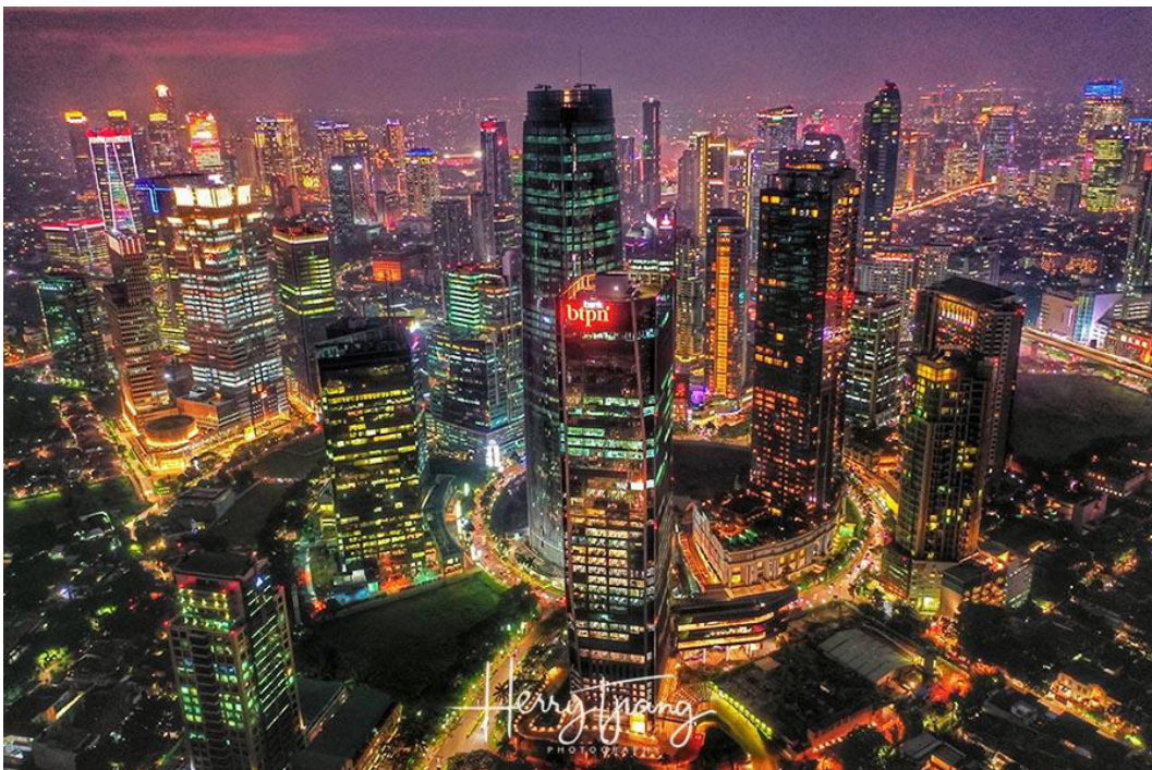
Figure 6. Mega Kuningan as part of Jakarta's Golden Triangle area