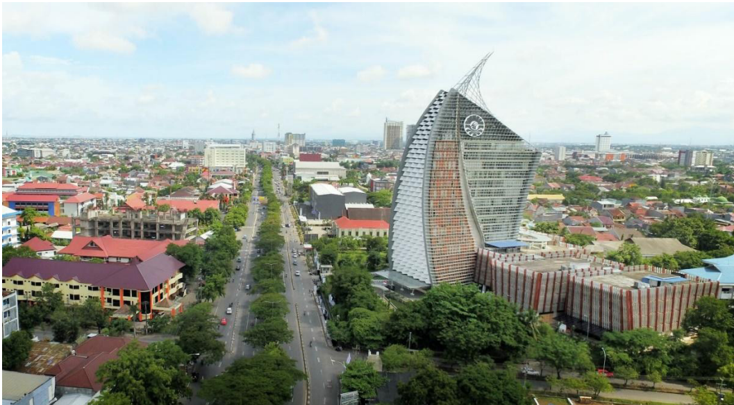
Figure 8. Phinisi Tower in Makassar, South Sulawesi used the silhouette of Phinisi Sailboat to 'contextualise' the modern building