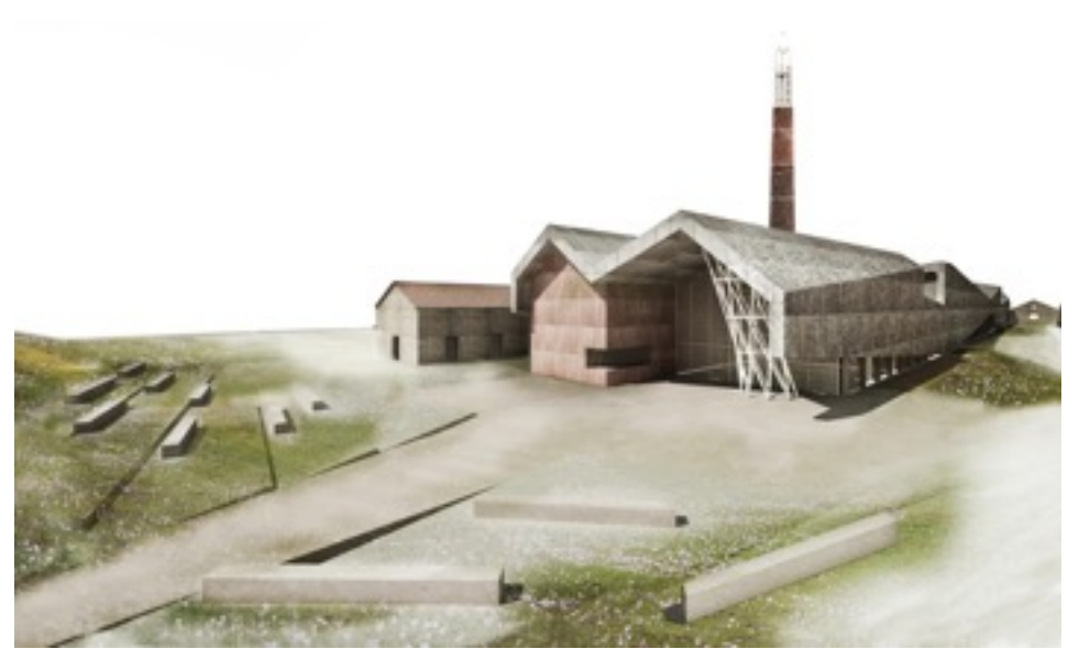
Figure 9. The square next to the sea and the system of exterior spaces