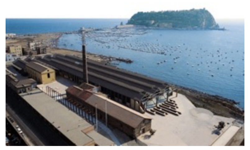
Figure 2. Città della Scienza before the fire: the relation with the landscape

It is important to clarify that the building to be reconstructed constitutes a delimited piece of a huge area which used to be a productive plant in Bagnoli, an area of great relevance from the landscape point of view, on which the city of Naples has been elaborating programs and projects for years and, until now, any of them was realized. It is just the case to consider that, moreover, nowadays, within the Neapolitan urban planning previsions, it is established that Città della Scienza will be moved out from its actual location.