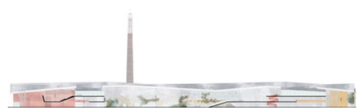
Figure 10. Dynamic of inner paths

related to the territory where the Science Centre is located, such as the morphological configuration, volcanic phenomenon, etc.