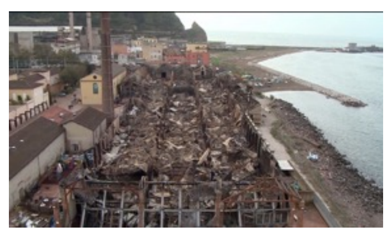
Figure 4. Città della Scienza after the fire in 2013