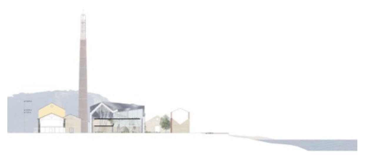
Figure 15. An architecture opens to the sea and the landscape Source: original drawings and design elaborated by the project team

The planned agora areas, which constitute fundamental spaces of internal aggregation, are three. The first one is located at first level where the outside is visible through the glass along the wide stairs. The other two are positioned in correspondence of the terraces, in continuity with the open spaces. From the northern side, in a closer way related to the temporary exhibition spaces, it is possible to access into a second part of the second level, in which other exhibition spaces, both open (terrace) and covered (multipurpose area of small size) are proposed.