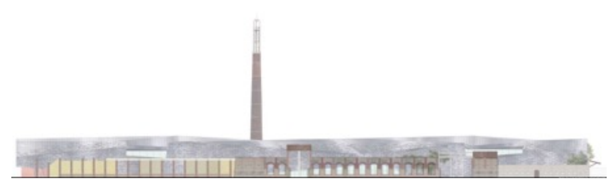
Figure 11. Front towards the sea

Directly connected to the theme of filtered direct light is the combination of resin floors, which will determine, with the appropriate colour graduations, a further element of variability and individuality of the spaces.