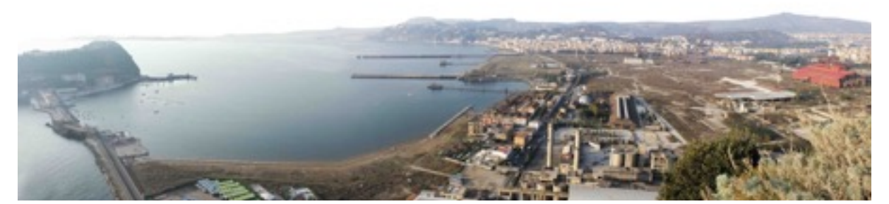
Figure 1. The landscape in Bagnoli plain, from Pozzuoli to Posillipo, after the fire in Città della Scienza

The New Science Centre of Città della Scienza in Naples has been the object of an international design competition held between 2014 and 2015, in which the main subject was the reconstruction of the building, destroyed in a significant way by a big fire in 2013.