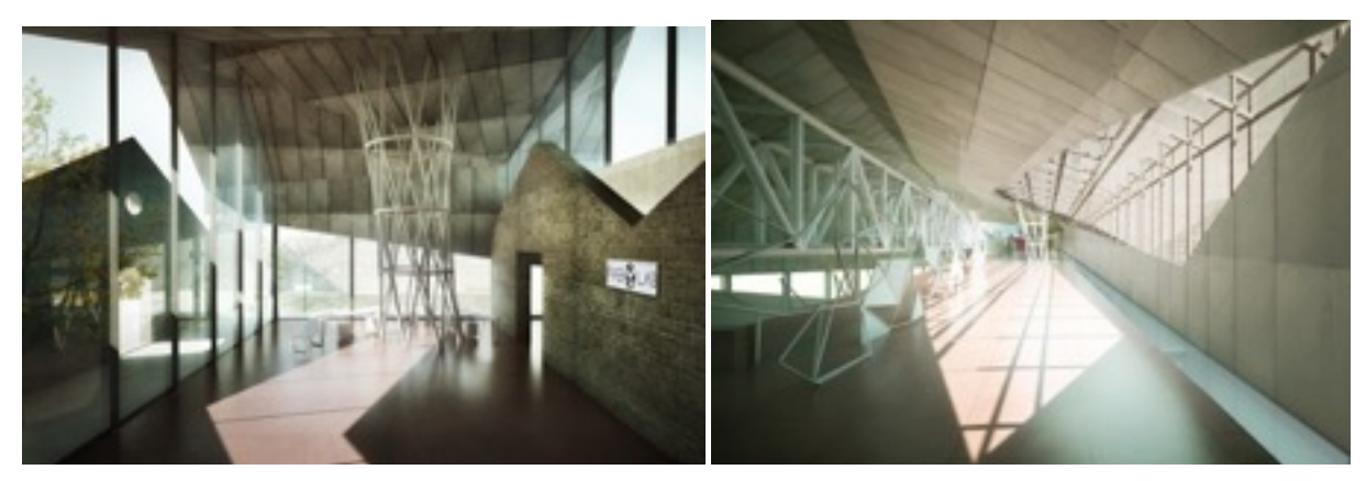
Figure 13. The inner spaces of the exhibition, between conservation of pre-existing elements and new structures

The two building's heads instead configure as more closed elements, under which the more specialized spaces have been arranged. In particular, in the northern side it is placed a large multipurpose space of the temporary exhibition and a café, while in the southern part the children workshop area was proposed, closely linked to the fenced outdoor area, and the Fablab (workshop of exhibit), also accessible by the visitors of the permanent exhibitions and provided of independent vehicle access.