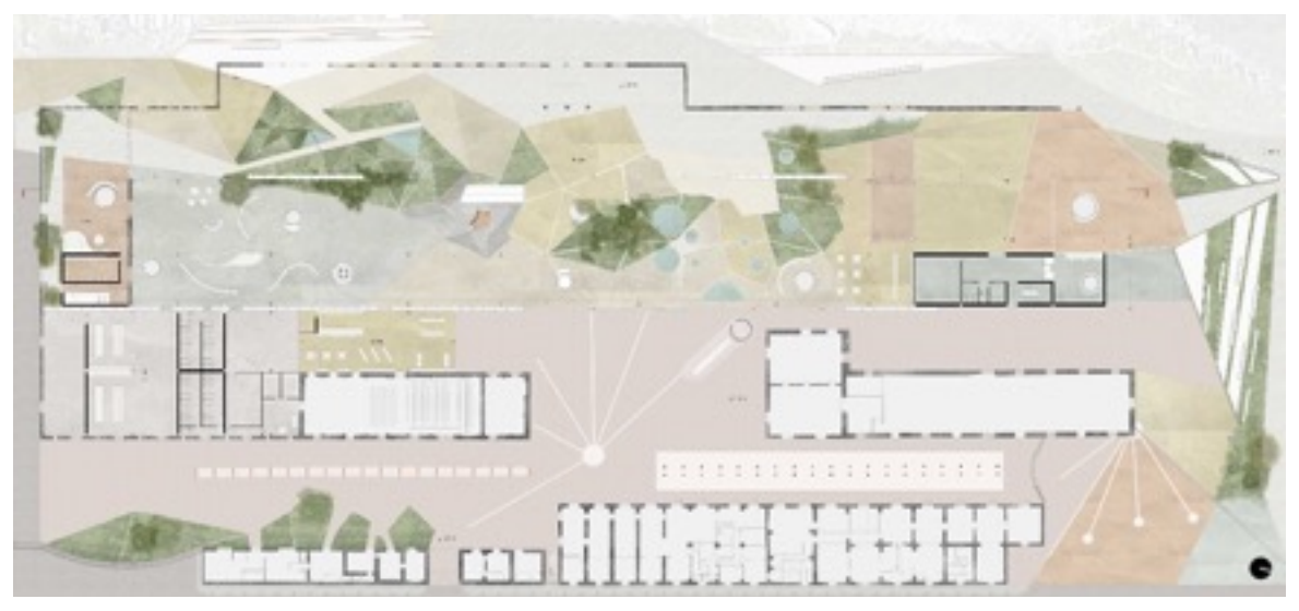
Figure 7. Plan of the ground floor: the continuity among inside and outside spaces

To the northern side of the building, that directly dialogues with the overpass connection of the bridge towards the other buildings belonging to Città della Scienza as well as towards the sea, an exterior space, wide and versatile, is connected, that gets characterized by different planes at various levels, by interpreting in this way the theme of the square next to the sea. In particular, a sort of wide and comfortable stairs has been designed as a place for events, with the north front of the building as the set on which some projections could be done. The square close to the sea represents in the project the perfect localization for a general ticket-office for the museum, as the keystone of the new building within the whole complex of Città della Scienza , by underlining this entrance through a particular volumetric articulation.