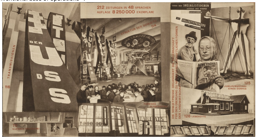
Figure 3. El Lissitzky's Soviet pavilion at the Press Exhibition in Cologne, Germany, 1928

Lissitzky breaks the idea of a single path and a single perspective, replacing it with a multiplicity and simultaneity of information and ways of perception in the midst of which the beholder becomes an active participant on the level of physical movement as well as through active meaning making, operating without a conventional base of operations<sup>12</sup>.