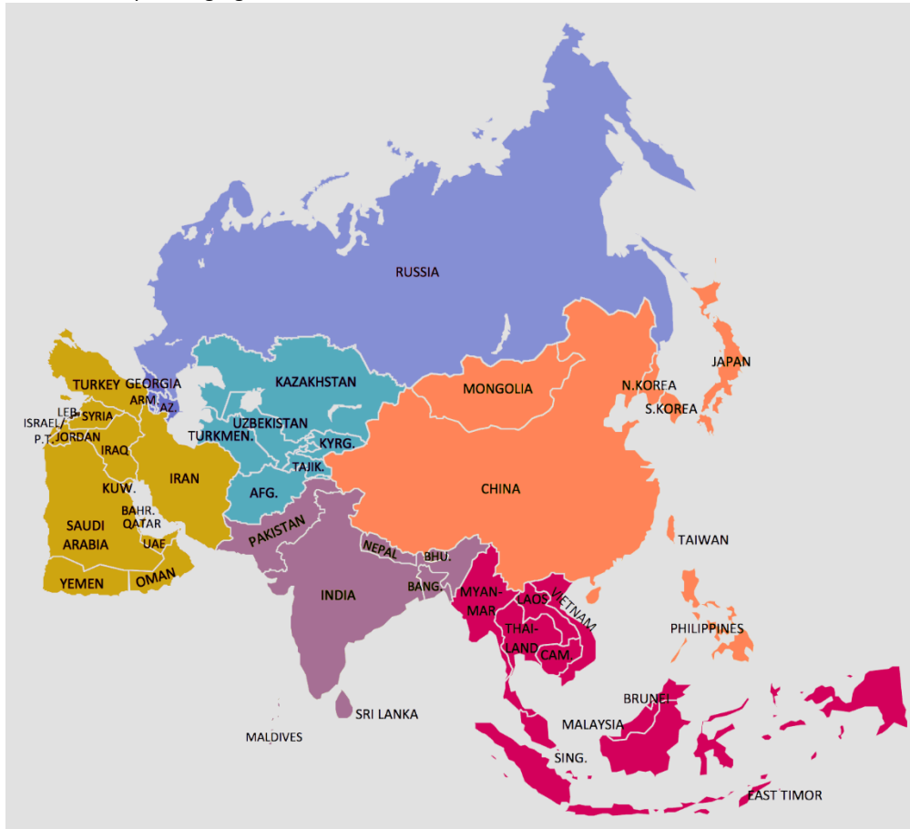
Figure 1: Map of Asia, Clustered on basis of sub-regions

the country with a high incident of corruption and terrorism. However, the political scenario of Gulf has never restricted any economic development rather these countries have been one of the most active investors and business groups around the globe. Apart from that Turkey, Georgia, Iran, and Yemen, are the countries which are not categorized in any subgroup, but recently these countries have also emerged with an increased political and economic stability. Turkey is the only secular state which has kept up with the democratic practices in the country since long. Apart from that, the political maturity has led to the development of economic perspectives which is expected to yield a positive outcome in the near future as Turkey is also expected to take the lead as one of the top emerging countries.