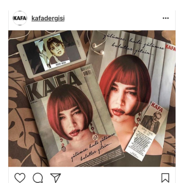
Figure 1. The repost of a reader by Instagram account of Kafa Dergisi, with famous Turkish pop singer Sezen Aksu cover and a youtube video one of her song on phone.