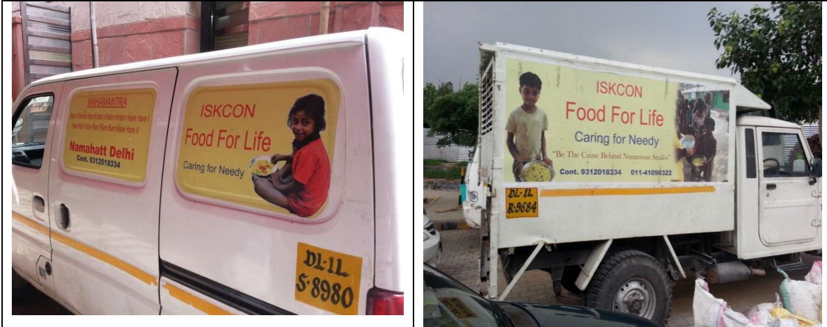
Figure 4: Food for Life Vans picking up and dropping food at various ISKCON temples across Delhi.

We are very restricted about the food habits hence we don't try it in a non-devotee restaurants (Indian male, late 30s).