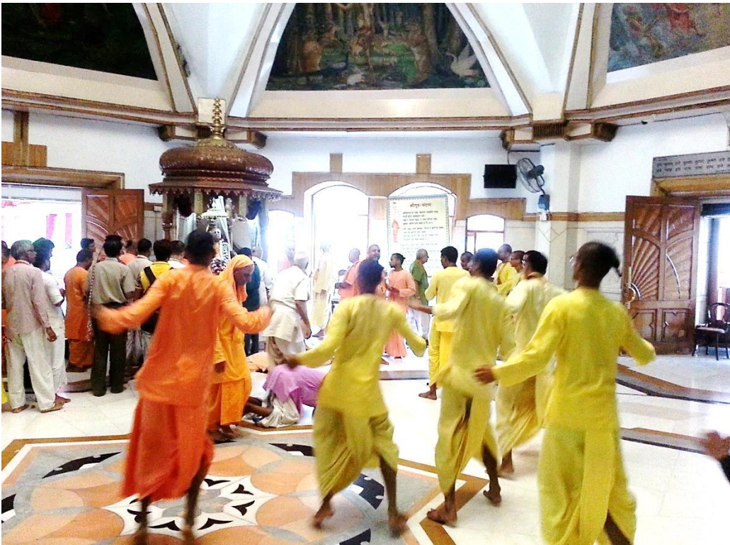
Figure 1: Singing and dancing Brahmacharis in the New Delhi temple.

Most of the Brahmacharis seen in the temple were usually younger (though there were quite a few elderly Brahmacharis too) and were always at the forefront of all the activity, especially the frenzied singing and dancing which happens every so often when the prayers start every few hours during the day (Figure 1). These young men were in red robes called Dhoti Kurta (long traditional men's garment and loose Indian shirt) with shaved heads and carrying their prayer beads around their neck (Figure 2). This group of devotees were initiated into the ISKCON philosophy and stayed unmarried and celibate.