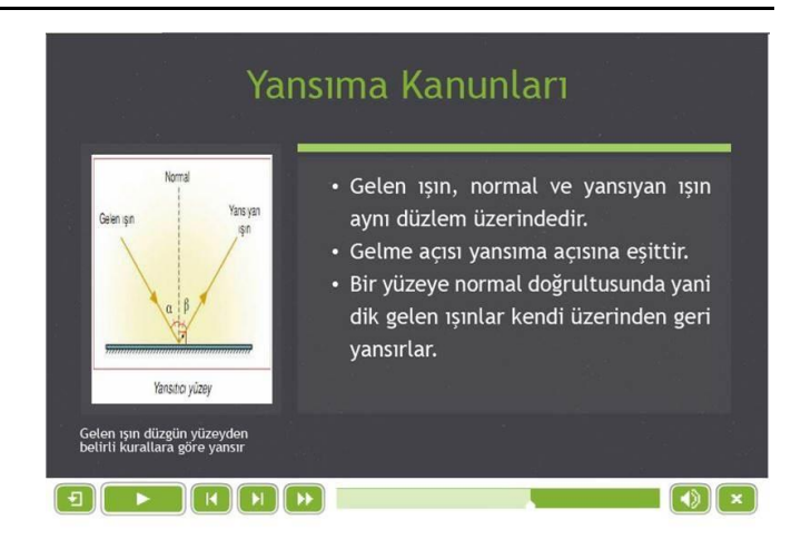
Figure 2. A screenshot from the learning environment

When the learning environment is designed; attention has been paid to the cognitive load of students, visual hierarchy, balance, integrity and colour harmony. In visuals and texts, storyboards were created in such a way as to avoid the excesses and to give the subject's essence, ordered according to the learning hierarchy. Designed for students' learning needs using the Adobe Captivate 9, this learning environment is published on the researcher's website. After making the necessary preparations, the teacher informed the students about the 20 student learning environment so that the application can be started. A sample screenshot of the learning environment in which the multimedia items are used together is shown in Figure 2.