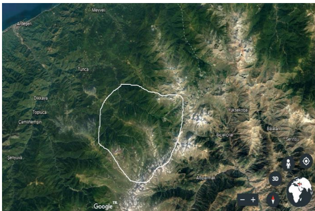
Figure 1. Map of the study area

The climatic data of Pazar station (Anonymous, 2011) were interpolated (Çepel, 1978; Doğan 1977) for the altitude of 1700 m. According to these interpolated data Walter climate diagram for the research area was drawn. The climate in the study area is very-humid, mesothermal without any dry season. The precipitation regime is as autumn, winter, spring and summer (Au.Wi.Su.Si.). January, February, March and December are the frosty months while April and November are the probable frosty months (Figure 2).