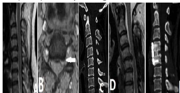
Figure 2: 43 years old female patient. Neck and left arm pain

One of the patients with a ruptured disc hernia, and three of the patients with foraminal stenosis underwent ADCF with anterior intervention in a postoperative year ( Figure 2 ).