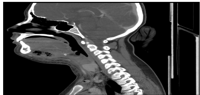
Figure 2b: Sagittal contrast-enhanced CT image. Air densities within the abscess (arrow) in the mouth floor, increased inflammatory density in the soft tissue, and enlarged lymph nodes in the submandibular region.