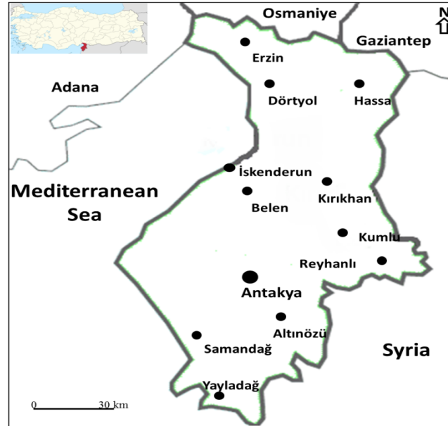
Figure 1. Map of the Hatay

more suitable for growth of fungi. During field studies, morphological and ecological characteristics of the macrofungi samples were recorded and they were photographed. After field studies, specimens were taken to the laboratory. Then spore prints were obtained and spores were photographed. Specimens were identified with the help of relevant literature such as; Marchand, (1971-1986), Dennis (1981), Watling (1982), Moser (1983), Breitenbach and Kränzlin (1984-2000), Cappelli (1984), Pacioni (1985), Watling and Gregory (1987, 1989), Bresinsky and Besl (1990), Ellis and Ellis (1990), Hansen and Knudsen (2000), Kränzlin (2005), Knudsen and Vesterholt (2008) and Kibby (2012). Newly recorded taxa were checked with the relevant literature: (Sesli and Denchev, 2014; Akata et al., 2014; Güngör et al., 2014; 2015; Kaya and Uzun, 2015; Solak et al., 2007, 2015; Doğan and Kurt 2016). Nomenclature is given according to Index Fungorum (Kirk, 2011). The identified specimens are kept at the fungarium of Muğla Sıtkı Koçman University.