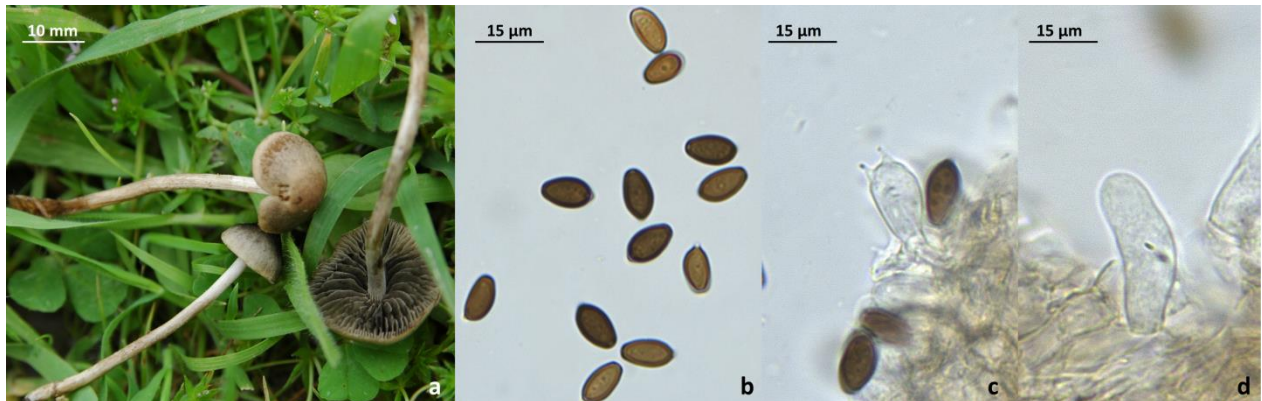
Figure 2. Panaeolus reticulatus a- fruit bodies, b- basidiospores, c- basidium, d- cheilocystidia

Basidia clavate, 25-30 × 10-12 µm, without a basal clamp (Figure 3c). Cheilocystidia cylindrical, 25-40 × 6-7 µm (Figure 3d). Grow solitary to gregarious in meadows, among grasses, in spring. Hassa, in meadow, 9.4.2006, Solak 2005.