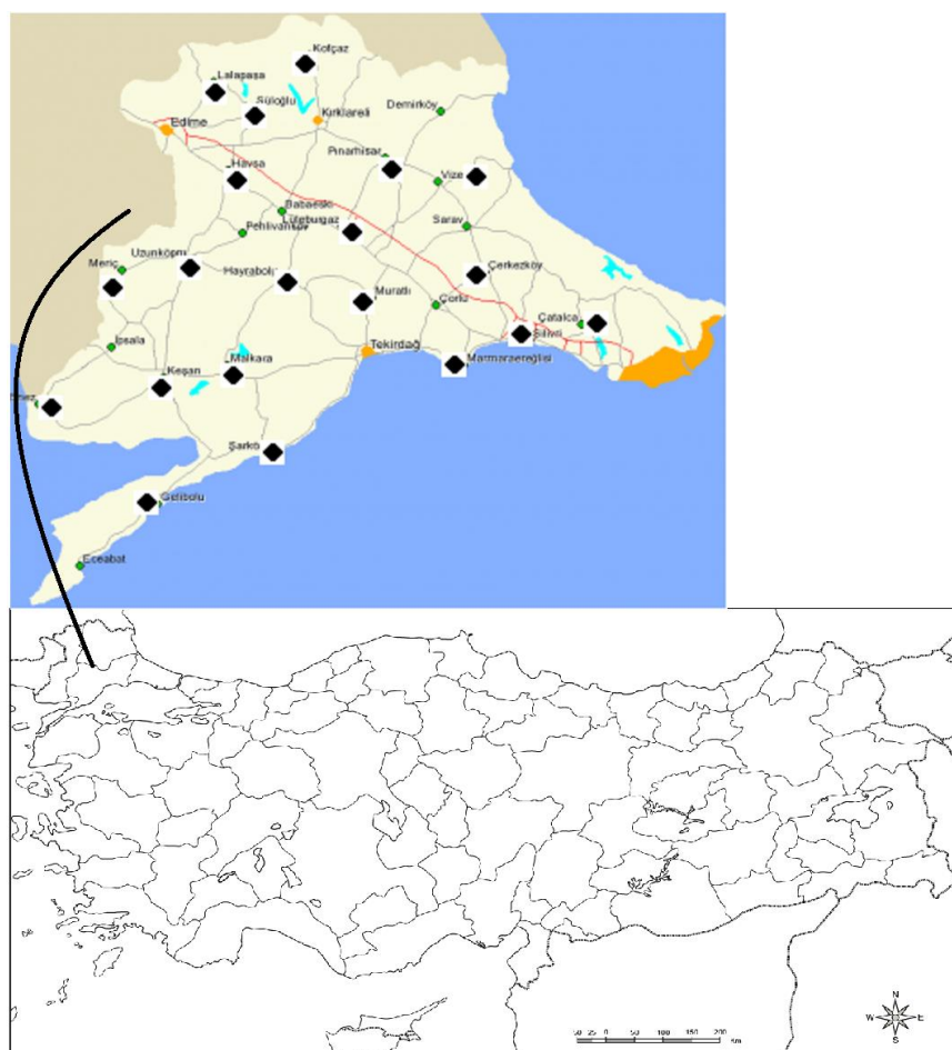
Figure 2.1. The map of locations in Thrace region of Turkey

The locations were determined based on differences in geographical structures with variable ecological conditions (Figure 2.1.). Plant samples were taken from 20 different points from areas away from residential areas (two in İstanbul, six in Tekirdağ, four in Kırklareli, seven in Edirne and one in Çanakkale) on 6-7 May 2013. The collection days had clear and sunny weather, the temperatures ranged between 17.2°C to 21.5°C. The altitudes of sampling locations varied from 6 - 518 m (Table 2.1).