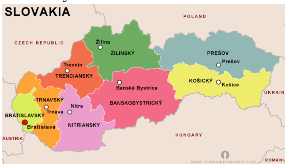
Figure 3 Slovakia's regions

The long-term development of the sectoral structure of SMEs is characterized by a growing representation of the services sector, which is accompanied by a decline in the trade sector.