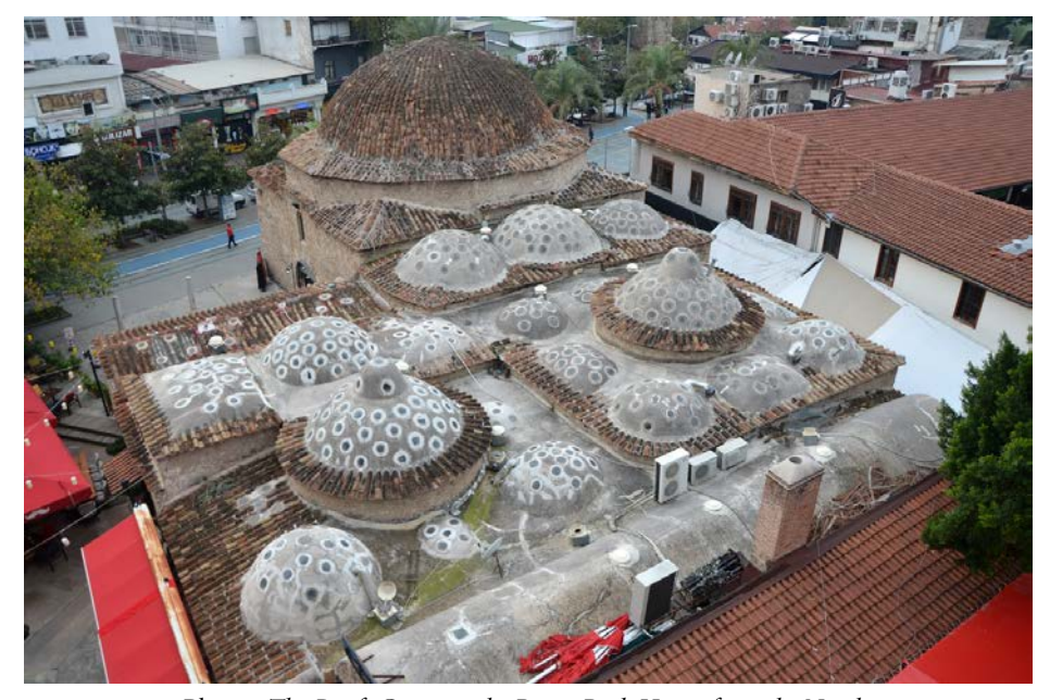
Plate 1. The Roofs Covering the Pazar Bath House from the North

Pazar (Double Bath) Bath : This bath house is located in the city center of Antalya in Balibey District, Cumhuriyet Street (plate 1). The building inscription of the bath has not survived to the present day. Evliya Çelebi, who came to Antalya in 1671-1672, mentions that there is Pasha Bath in the city center<sup>4</sup>. In addition, the Waqf of Mehmet Aga bin Osman Aga dated 1811 gives the name