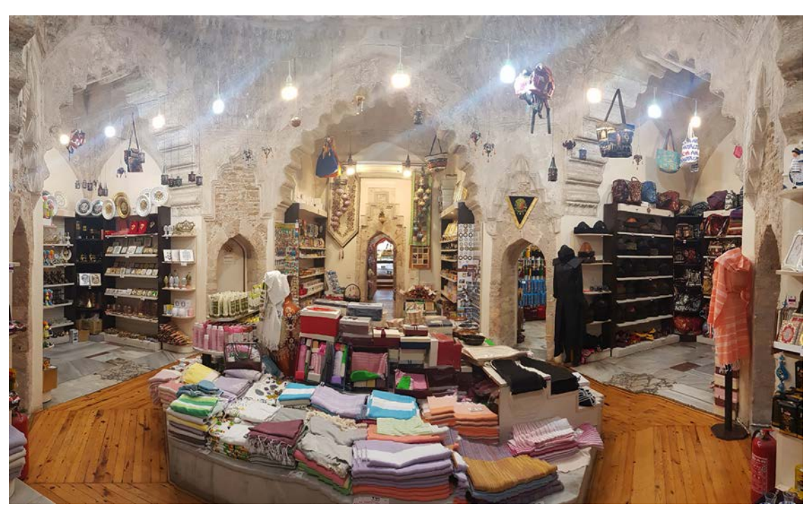
Plate 3. Inner View of the Pazar Bath