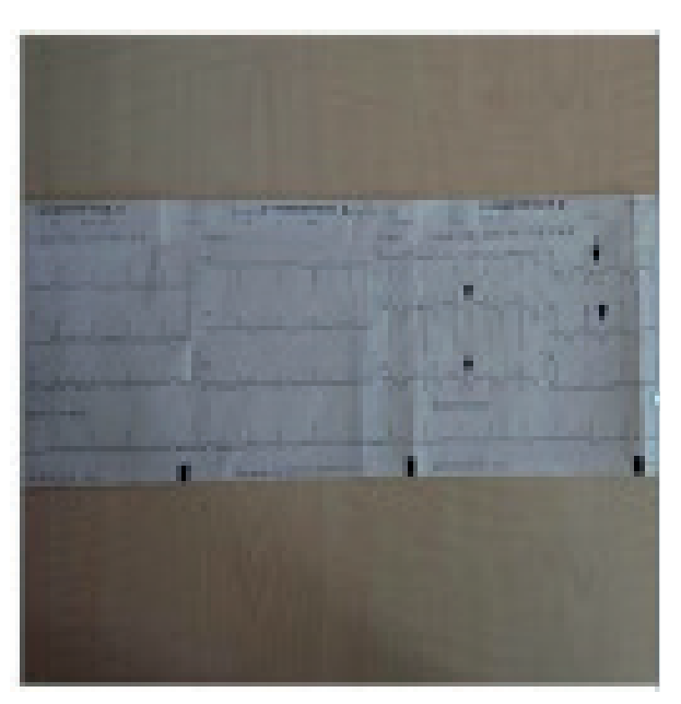
Figure 1. Electrocardiographic findings

A 41-year-old female patient was admitted to the emergency room with chest pain. In her histroy she has hypertension but not regularly taking medications, Raynaud phenomenon (diagnosed 3 years ago) and followed for 2 years without medication. An angiography had been performed about 6 months ago with a complaint of similar chest pain. A non-occlusive coronary artery disease in the mid region was found in left anterior descending artery (LAD). Electrocardiography (EKG) showed sinus rhythm at 104 / min heart rate, on precordial derivation 1-6 ischemic t wave negativity and prolonged QT (Figure 1). Echocardiography revealed that there were normal ejection fraction. With high troponin value the patient was taken to the angiography laboratory after the onset of chest pain. Cardiopulmonary resuscitation was performed after sudden cardiac arrest before angiography was performed. EKG turned to sinus rhythm after defibrillation. Coronary angiography showed 99% stenosis in osteal LAD (Figure 1).