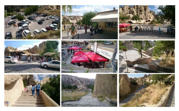
Figure 2. Some facilities and landscape properties of Göreme Open Air museum (A: Parking lot front of main entrance, B: Ticket office for museum entrance, C: Tourniquets, D and E: Ornamental shop stores, F: Sign for WC, G-I: Stairs and slope footpath).

Figure 2 shows some photographs of Göreme Open Air Museum and some facilities with some landscape properties.