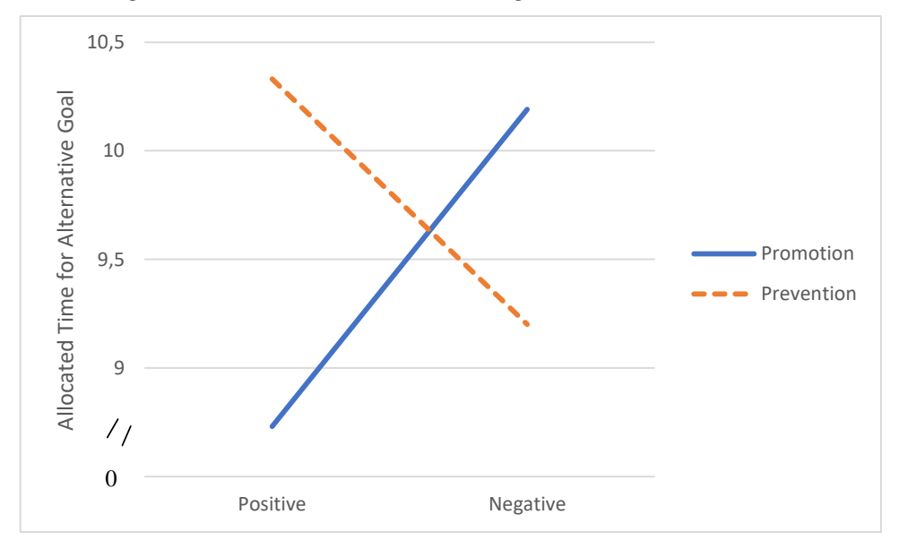
Figure 2. Plotting the Interaction between Framing and Feedback on Alternative Goal Time

Results showed that the fit between regulatory orientations and feedback valence led to an increase in the motivation on the alternative goal, which was depicted by increased allocated time. Therefore findings of the current study supported the hypotheses. Specifically, results supported both cybernetic models and attitude research on feedback effects on multiple goal-pursuit. On the one hand, in line with the cybernetic models' propositions (Carver & Scheier, 1998), participants allocated more resources to the alternative goal after positive feedback only under prevention non-fit condition and allocated more resources to the focal goal after negative feedback only under prevention fit condition. On the other hand, in