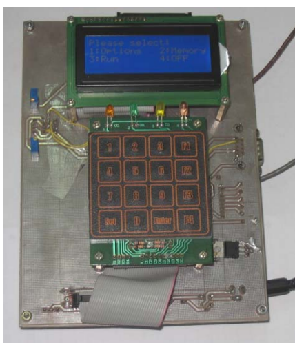
Fig. 1. Microcontroller-based data logging system

50% peak safe overload of 3.3 kN. The hydraulic cylinder oil pressure is regulated to 7 MPa (read on a pressure gage) so as to not allow the force greater than 2.2 kN. With this pressure, the maximum measurable cone index is nearly 7 Mpa which is usually sufficient enough even in most hardpan soil conditions. However, the system can measure the cone index up to 10 MPa. Typical values of cone index that stop root growth are near 2 MPa (Price and Throit, 2003). If this maximum allowable force is not enough for a particular soil condition, then a cone with lower diameter can be used. Input voltage of the Wheatstone bridge is 5 V powered by regulating the voltage of tractor's battery.