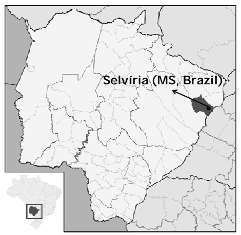
Figure 1. Geographic situation of the study area. The study area measures 0.16 ha (40 m x 40 m) and was divided into a sampling grid containing 117 sampling points (Fig. 2). The sampling grid presents 81 points with 5 m x 5 m spacing and 36 points with 1.67 x 1.67 m spacing.

This work was carried out during the agricultural year 2005/2006, in Fazenda de Ensino, Pesquisa e Extensão of the Faculty of Engineering of Ilha Solteira – UNESP, situated in the county of Selvíria (MS), at latitude 22°23'S and longitude 51°27'W (Fig. 1), with mean annual precipitation of 1300 mm and mean temperature of 23.7°C. The soil studied is an Oxisol (USDA, 1996) equivalent to "Latossolo Vermelho distroférrico" (EMBRAPA, 2006).