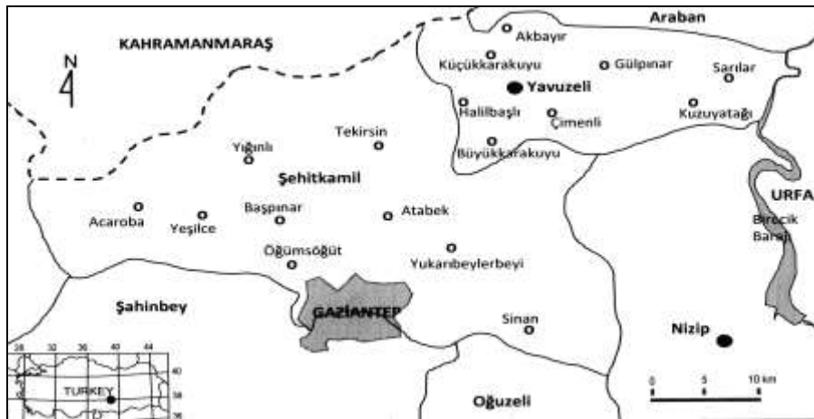
Figure 1. Map of the research area

Yavuzeli and Şehitkâmil are the two districts of Gaziantep province within southeastern Anatolian region of Turkey and in C6 square according to Davis' grid square system. The districts are situated between 36°59' - 37°23' north latitude and 37°00' - 37°52' east longitudes and encompasses a surface area of 1694 km 2 (Figure 1).