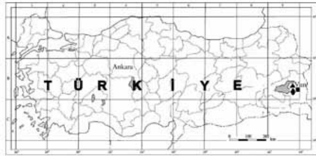
Figure 2. Distributions of Cousinia x kurubasgecidiensis (◆) C. vanensis (■) C. boissieri (▲)

Van Lake region in Türkiye is an important center of biodiversity for Cousinia . Hybridisation of the genus occur generally in this area. The hybrid is occurring in a small area named as Kurubaşgeçidi on Van and Gürpınar road, almost 10 km. from Van city and at (1700-)1900-2300 m. Vegetation of the area is antropogenic steppe on vulcanic rocks. Elevation of the pass almost 2300 m. at peak and 1700 m. at the base. The area have a strong earthquake and eroded and sandy places and also rich floristical structure and poor vegetation. In the vegetation; Astragalus L. spp., Cousinia vanensis , C. boissieri , Centaurea virgata Lam., Glaucium corniculatum (L.) Rud., Crambe orientalis L., Gypsophila bicolor Freyn & Sint., Echinophora orientalis Hedge & Lamond, Scorzonera latifolia (Fisch. & Mey.) DC., Cerinthe minor L., Phlomis armeniaca Willd., Salvia multicaulis Vahl., Salvia kronenburgii Rech. fil., Delphinium carduchorum Chowdhuri & Davis, Delphinium cyphoplectrum Boiss., Isatis glauca Aucher ex Boiss. subsp. iconia (Boiss. & Heldr.) Davis, Linum pycnophyllum Boiss. et Heldr. subsp. kurdicum Davis, Marrubium parviflorum Fisch. et Mey. subsp. oligodon (Boiss.) Seybold are dominant.