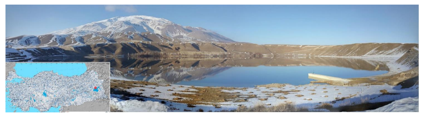
Figure 1. The Lake Aygır.

Lake Aygır (38 ^{\circ} 50 ' 14 " N, 42 ^{\circ} 49 ' 20 " E) is located on the south of Mount Suphan in Adilcevaz, Bitlis (Figure 1, Golden Software 2010, Google Earth, 2018). There is a village on its shore. The water of Lake Aygır has a freshwater character and is used for drinking, irrigation, fishing, cage aquaculture, and recreational activities. No industrial establishment was found in the region. (Güllü and Güzel, 2006; Elp et al., 2014; Çavuş and Şen, 2018; Çavuş and Şen, 2020).