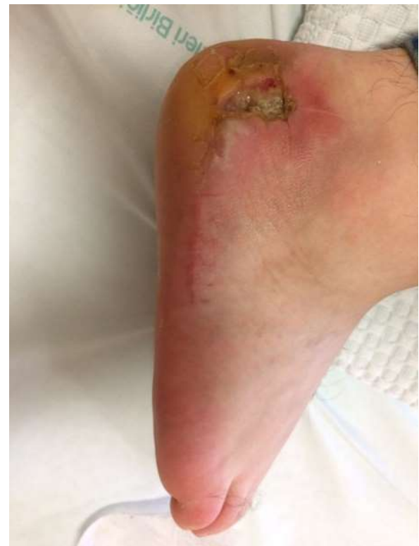
Figure 3. A wound complication

Deep infection happened in three patients in OR group. All of them healed with parenteral antibiotics. No deep infection occurred in PR group. Wound complications, except infection, occurred in five patients in OR group (Figure 3).