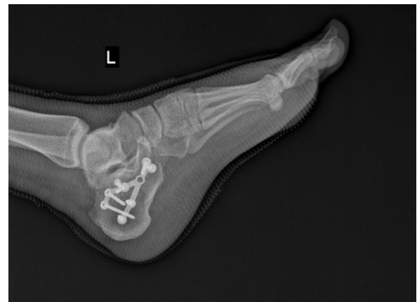
Figure 2. Lateral cortex

heel was achieved in this stage, with great care to avoid varus alignment. Then, posterior facet was elevated with the help of a periosteum elevator and reduced. A Kirschner wire was inserted from the lateral aspect of the posterior facet to the subchondral bone of the medial constant fragment. A lag screw was implanted in this stage in some cases. Bony defects were filled with spongius allografts and especially posterior facet was built-up inferiorly. Lateral cortex was reinserted, anatomical calcaneal plate was implanted and fixed with screws in appropriate sizes (Figure 2).