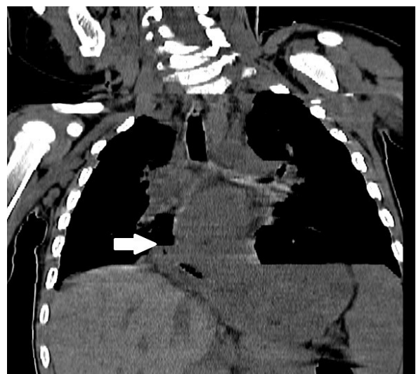
Figure 1C. Coronal section reformatted thorax CT demonstrates the partial herniation of stomach into thorax