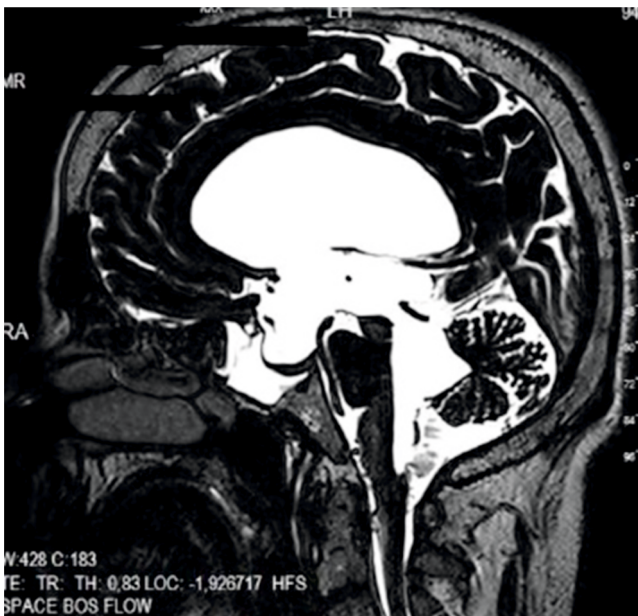
Figure 1. Magnetic resonance cisternography showing cerebrospinal fluid leak into sphenoid sinus.

A 34-year-old male patient was referred to our clinic with complaints of serous nasal discharge for 10 days following a severe headache lasting for 3 days. The patient had undergone VP shunt operation by the senior author of this paper 22 years ago with the indication of secondary hydrocephalus due to meningitis. His neurological examination was unremarkable. On cranial computed tomography, tetraventricular hydrocephalus was observed. During magnetic resonance cisternography, radio-opaque substance (Magnevist®; Schering Diagnostics AG, Berlin, Germany) was administered intrathecally and CSF leak into sphenoid sinus was observed while the patient was in prone position (Figure 1).