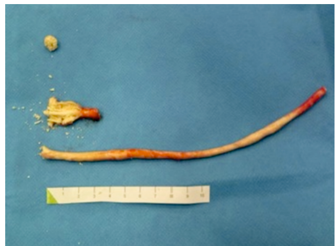
Figure 3. Calcification observed in the peritoneal part of the shunt.