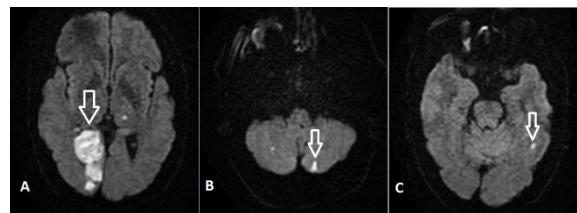
Figure 1. The brain MRI section of the patient.

In this report, we present a case that had left homonymous hemianopsia (HH) and cerebral infarct on cranial CT following coronary angiography.