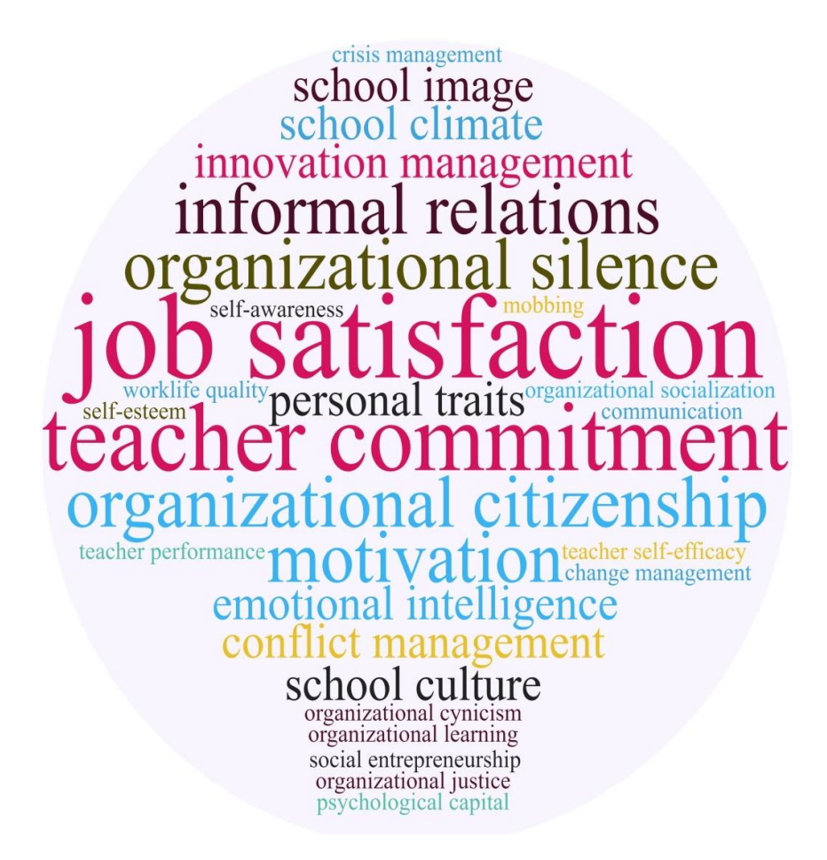
Figure 1. Variables That are Related to or Predict Transformational Leadership

Journal of Qualitative Research in Education - JOQRE