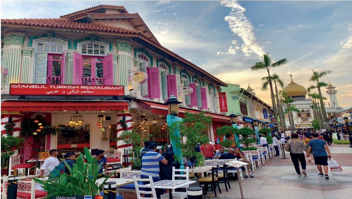
Photo 1: Rehabilitated buildings through conservation in Singapore (Malay-Muslim Quarter).