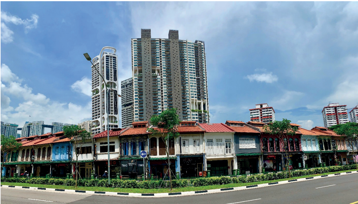
Photo 2: Buildings rehabilitated by conservation along Joo Chiat Avenue (Singapore).

succeeded in protecting their attractiveness by adapting themselves to new economic conditions in relation to tourism, such as recreational activities. Considerable gains have been obtained from tourism and recreational activities as a result of increased value in small and carefully confined locations mostly in the inner-city areas such as Bath, Chester and Norwich in the