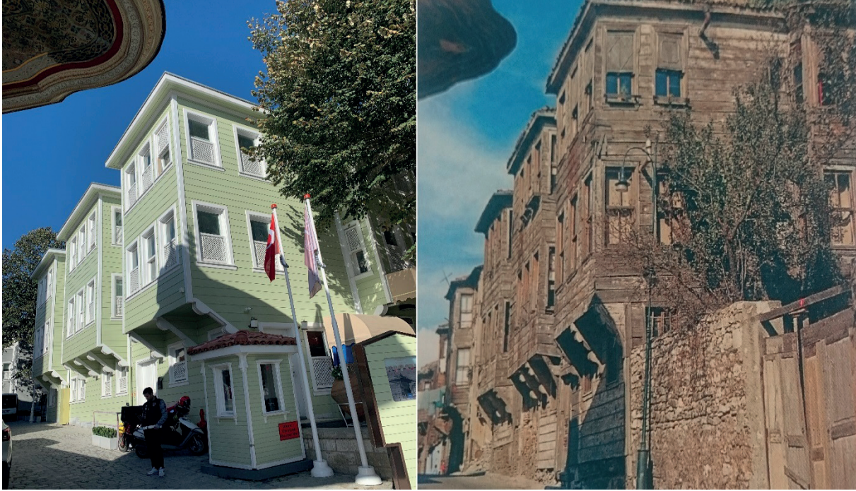
Photo 3: Old and new views of Hagia Sophia Mansions in Soğukçeşme Street, Hagia Sophia.