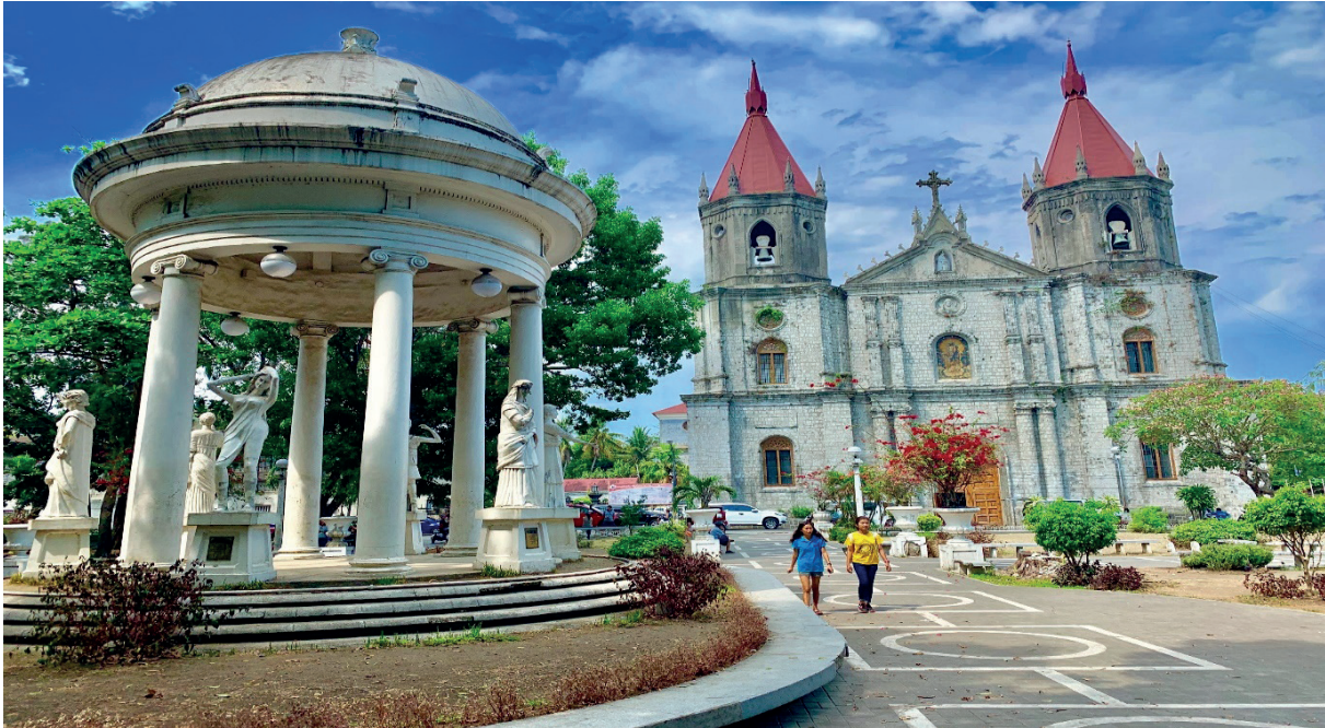
Photo 4: St Anne's Molo Church build with gothic architecture in 1831, Iloilo.

solidarity right (Dadak, 2015). It should be noted that the councils formed long years ago (International Monuments and Sites Council, International Museums Council) and conventions made (Venetian Convention, Convention Concerning Conservation of World Natural and Cultural Heritage) are implemented in line with the economic development of the countries.