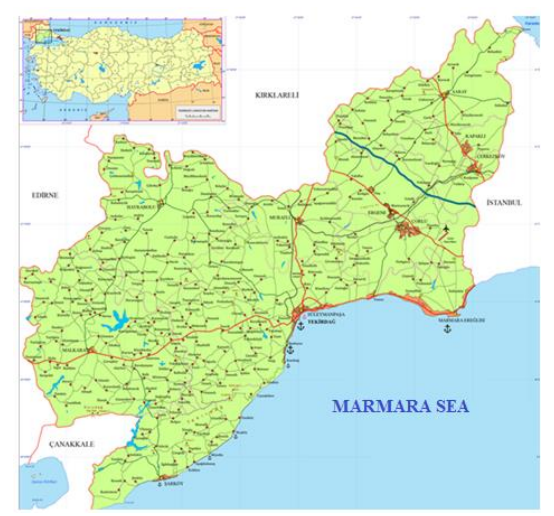
Figure 1. Tekirdağ province map (URL-2,2020)

Our city is Turkey's north-west, north of the Sea of Marmara, is located in the Thrace region, east of Istanbul, north of Kırklareli, Edirne, western, southern and is surrounded by the Sea of Marmara. Our province, which is located in a developed transportation network, has 3 important highways and is connected to Istanbul and neighboring European countries with a large foreign trade port and Istanbul-Europe railway line. Tekirdağ, which is located in the south of the Thrace Region, has a 2.5 km long coastline to 133 km from the Sea of Marmara (Figure 1) (URL-1, 2018).