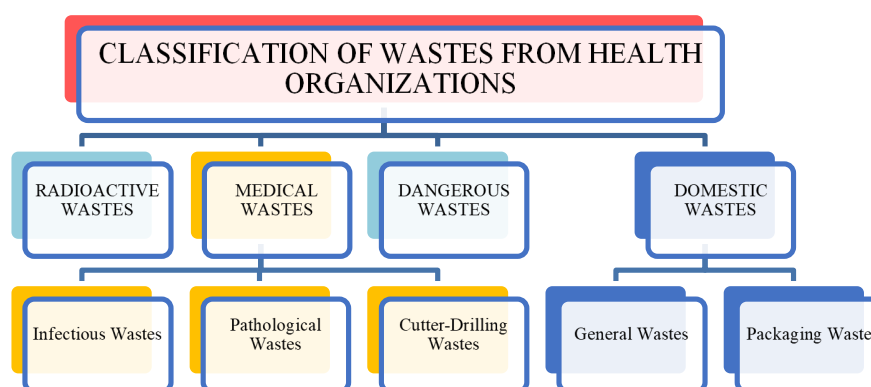
Figure 1. Classification of medical wastes [2]

differences in the management of medical waste [2]. Today, studies on the evaluation of waste are gaining a different dimension. Scientists now adopt environmentally friendly approaches rather than disposing of waste. In this regard, evaluation, transportation, disposal of medical wastes, etc. Minimizing the harmful effects that may occur in many stages is important in terms of its effects on the environment and human health. Failure to mix medical waste with hazardous and household waste will play an active role in preventing pathological waste from spreading. Thus, the control of medical wastes can be easier [4]. Medical wastes need to be classified according to their use, resources, storage and final disposal processes, taking into account the risk factors. The European Union attaches great importance to the classification of waste in the standards it creates.