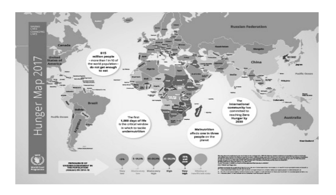
Figure 2: Hunger Map of 2017 [8]

In other respects, it is stated that more than a quarter of the world's population, 1.9 billion people are overweight, and 600 million of them are obese. According to the literature, about 3.5 million people die every year due to excess weight. It is also among the data that the costs of malnutrition or overfeeding have reached the world economy of 3.5 trillion US dollars [7].