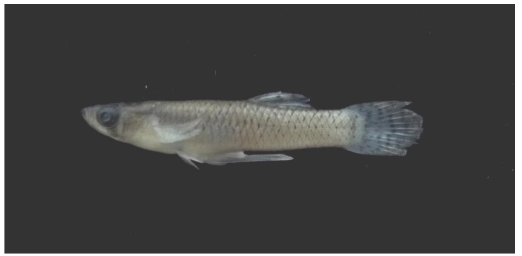
Figure 2. Gambusia holbrooki Girard, 1859, male, 2.9 cm TL, Manyas Lake, 2019