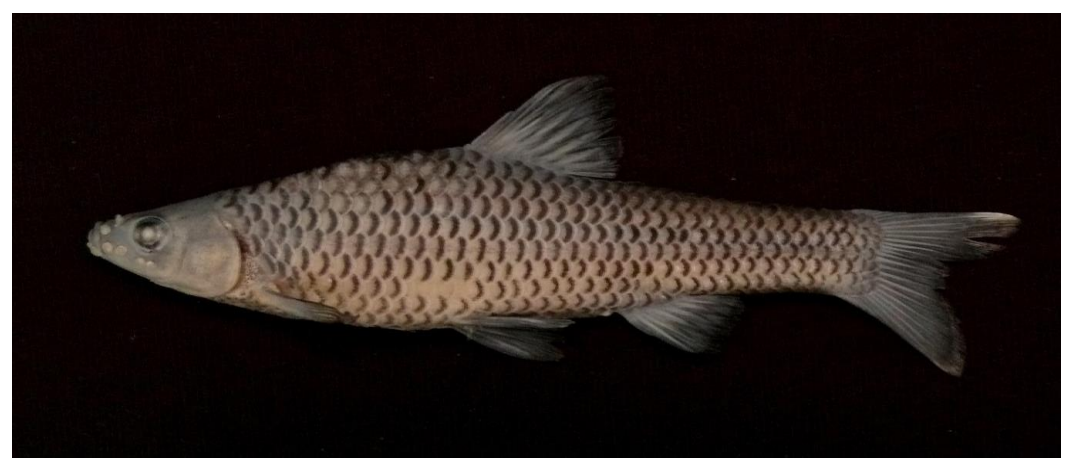
Figure 3. Pseudorasbora parva (Temminck & Schlegel, 1846), male, 8.0 cm TL, Manyas Lake, 2019