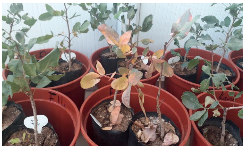
Figure 1. Symptoms caused by Rhizoctonia Rs2 isolate on the upper part of the pistachio saplings