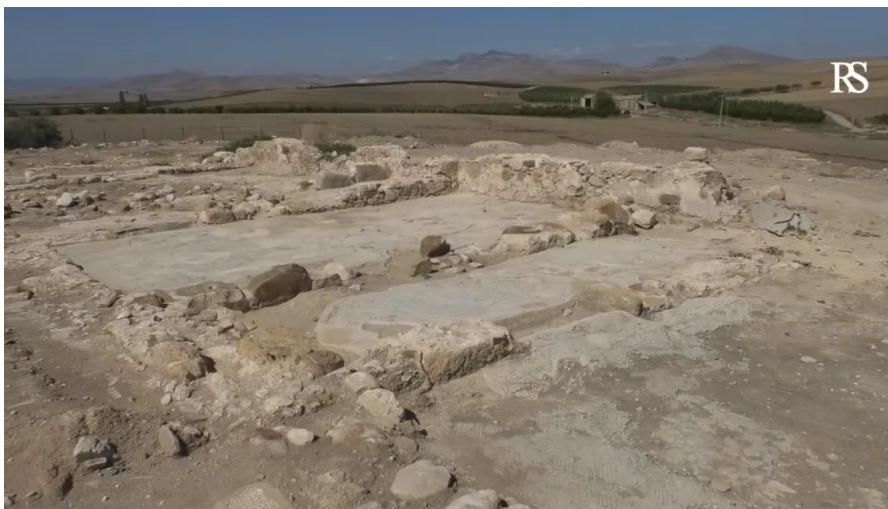
Figure 3 Detail of mosaic fragment in the east side of the Room 1.

Starting from the western end of the northern pavilion, the first room (Room 1 - "essay F", see Albanese - Procelli 1988-1989: 12) presents rectangular plan, the function is unknown. We can see only a fragmentary part of the east side of the mosaic floor, which allows us to hypothesize a possible reconstruction. The mosaic on a white ground presented a composition of swastika-meander with double returns, forming rectangles opposed in pairs (to create double T) with a lozenges included (Fig. 3).