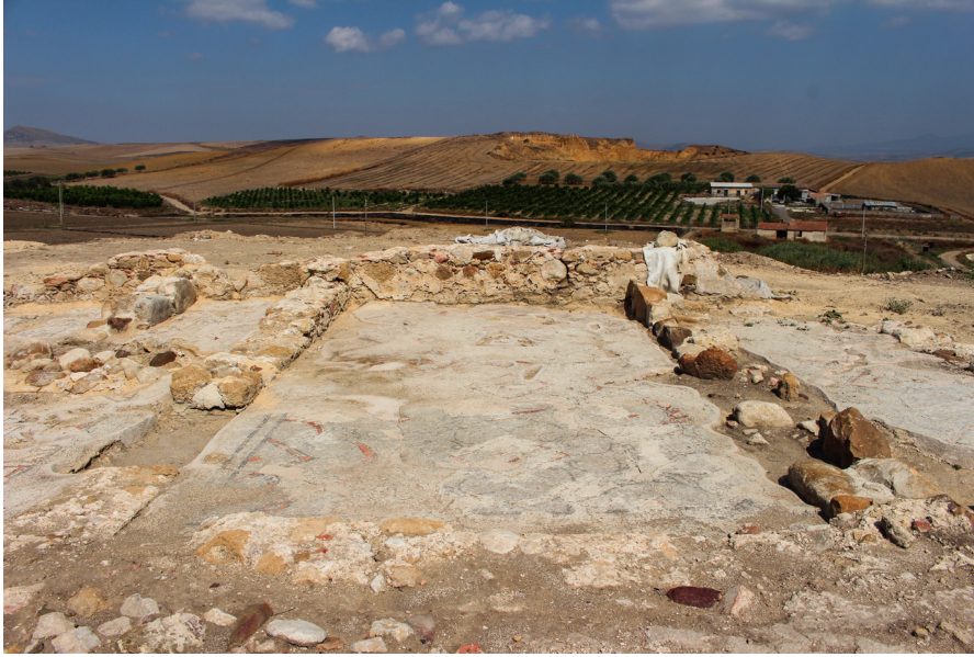
Figure 5 Mosaic pavement of the largest sector of the Room 3.

peltas of each square are alternately with red and blue arches, so that the couples of faced peltas appear to contrasting colors.