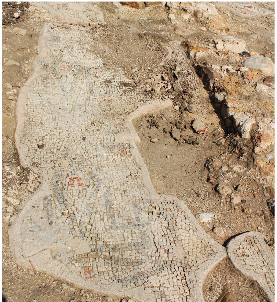
Figure 4 Mosaic pavement of the narrow sector of the Room 2.

The next Room 3 has the same characteristics as the previous one, which was later divided into two rooms, also here a narrower one and a larger one. The mosaic of the room, brought to light in the essay "A" during the excavations of the 80's (Albanese - Procelli 1988-1989: 12), covers the entire floor surface (Fig. 5). It has a frame consisting of double filet of blue-greyish tesserae. The central field, framed by a further double filet, has an orthogonal composition of squares with peltas ending with volutes in each vertex, and not contiguous circles on a white ground (for the graphic typology see Décor I : pl. 226d).