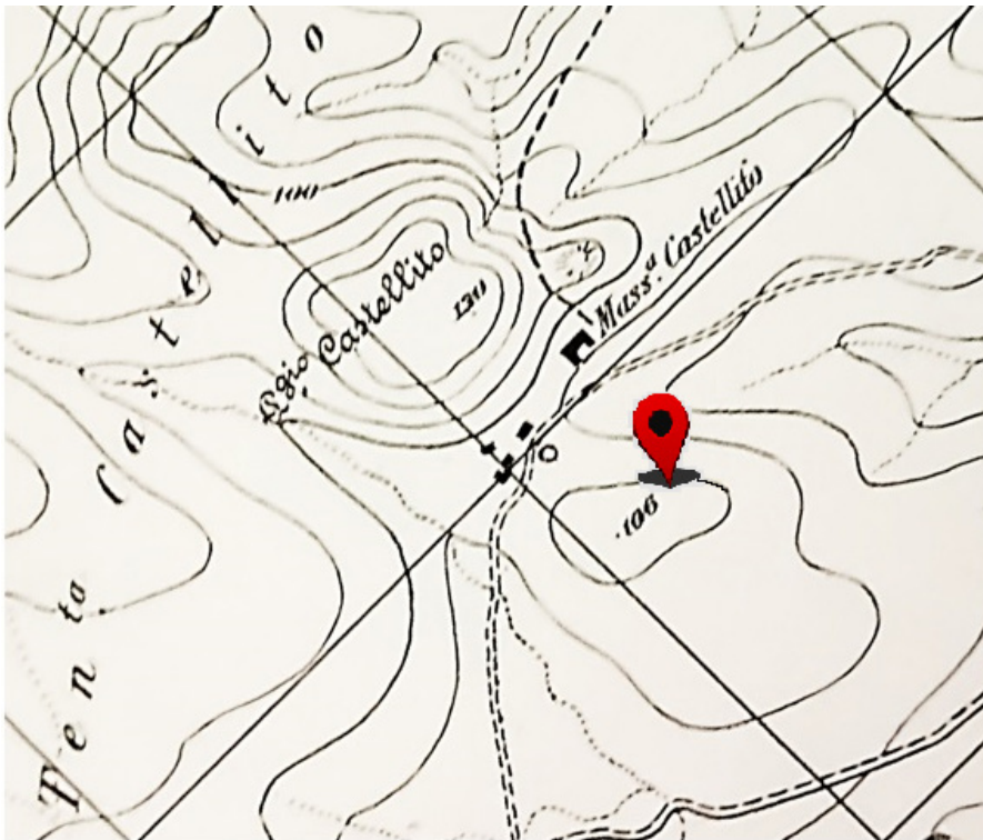
Figure 1 Extract of I.G.M. topographic map f. 269, II, N/O (re-elab. by D. Di Caro).

The Roman villa of Castellito (Monte Turcisi IGM f. 269, II, NO; Fig. 1), in the territory of Ramacca, is 2.5 km southeast of the Masseria Castellito and about 2 km west of the river Dittaino, on a plateau about 106 m above sea level, looking to the North-Eastern side of Etna.