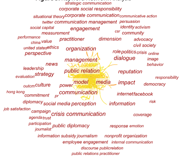
Figure 3: Keyword Network Analysis

The network is composed of 182 nodes and 1009 connections. IT is divided into 7 clusters and the density is 0.06. Modularity value is Q:0.35 and mean silhouette value is 0.71.