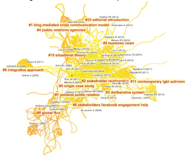
Figure 4: Co-citation Network Analysis

The network is composed of 475 nodes and 1680 connections. It is divided into 13 co-citation clusters and the density is 0.01. Modularity value is Q:0.80 and mean silhouette value is 0.40