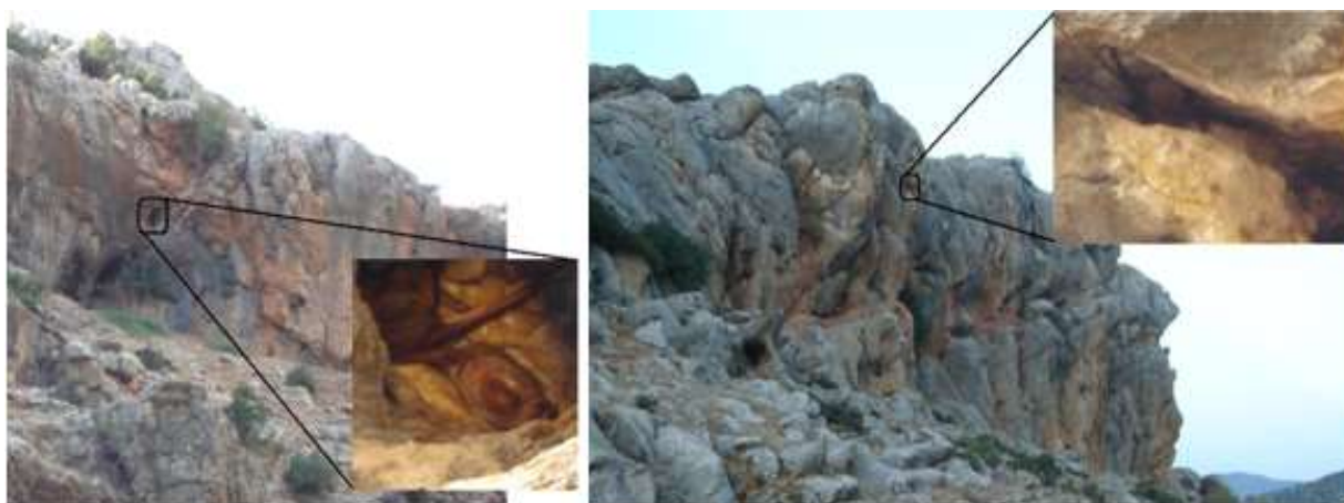
Figure 2. Recently determined locations of Taphozous nudiventris

Sample number (7) and locations: Gaziantep, Nizip, Mağaracık 2 (2 ♂♂, 02 September 2004), Kilis, Musabeyli, 5 (2 ♂♂, 10 July 2006; 3 ♂♂, 31 August 2007).