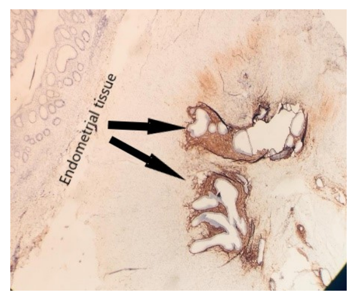
Figure 2: Histopathological finding; definition of endometrial tissue by stromal and cytoplasmic staining with CD10 indicator

She was discharged postoperative first day, had uneventful recovery and was free of symptoms during the 2 months follow up.