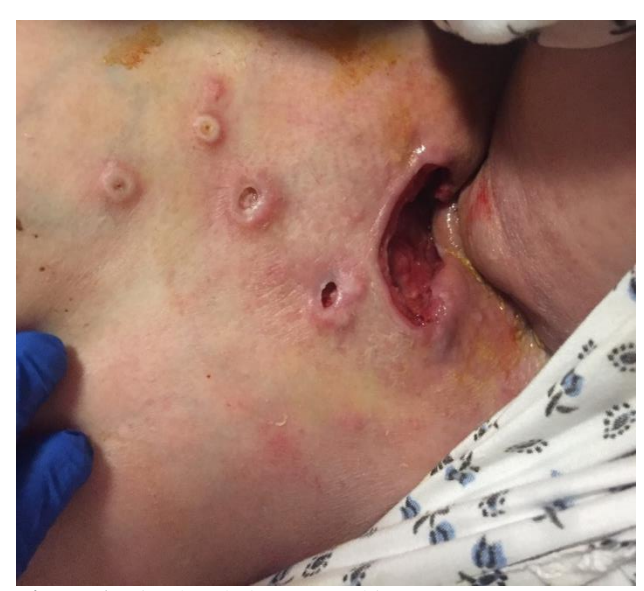
Figure 1. Fistulated abscess to skin

Skin metastasis as the first symptom is seen in 20% of cancer patients (5). First of all, skin metastasis in lung and kidney cancers could be seen as the first symptom (8). Skin metastasis have clinical different meanings. It could be the first symptom of a silent cancer. Brownstein and Helwig report that this is especially seen in lung and kidney cancers (9). Therefore in patients with a history of new developing skin lesions, especially in older patients, smokers and patients with a history of cancer in their families, histopathological diagnosis by taking a biopsy from the lesion is necessary to exclude the possibility of malignancy. Metastatic skin lesions are usually 1-3 cm in size and hard, painless, mobile lesions with normal skin color (7). Rarely, fruncle-like nodules, erosions, and ulcerated granuloma-like papules may occur (10-12). In