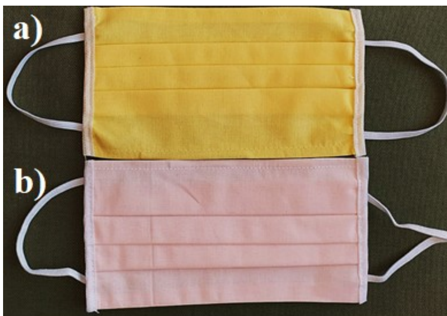
Figure 3: Masks dyed with Curcumin Longa (a) and Allium Cepa (b) extracts.

emission time was determined as 48h for a mixture of (lavender + clove) oil. Mint, rosemary, and juniper oils provide odor emission for 24h only. Masks dyed with Curcumin Longa and Allium Cepa extracts are given in Figure 3.