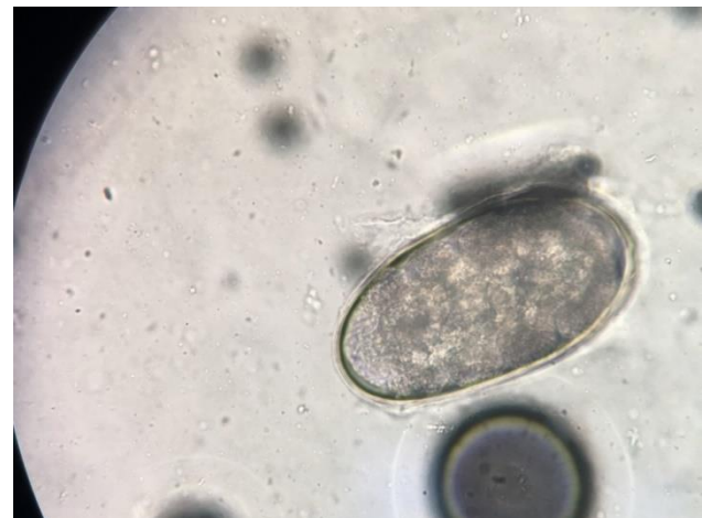
Figure 3. Mite Eggs (20X)

With large amounts of mites identified on the body, the patient was asked to bring dust samples from 4 different areas of her house. The patient was told to place all dust obtained in a closed large container after vacuuming the living room, bedroom, hall and kitchen with an electric vacuum cleaner, and to bring it to the parasitology laboratory immediately.