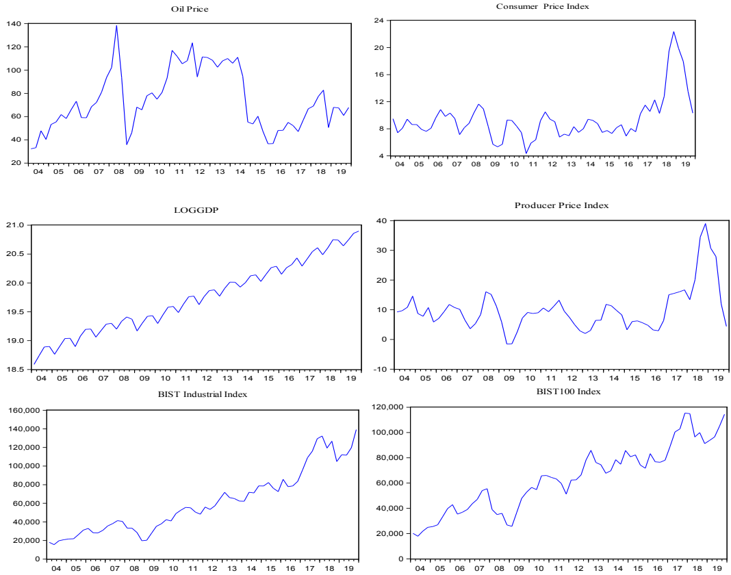
Figure 4 : Fragility of The Series

When the graphics of the series in the model in Figure 4 are analyzed, it is seen that there are vulnerabilities in the graphics of the series in the period in 2004Q1-2019Q4. For this reason, it is more appropriate to examine the unit root test with a break here. Break unit root test results are shown in Table 5 below.