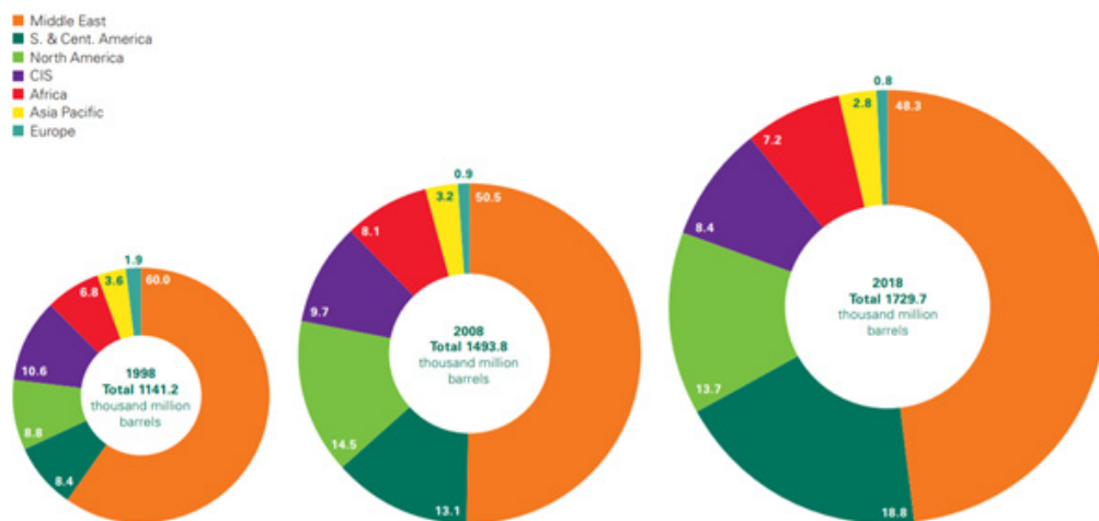
Figure 1 : Distribution of proved reserves in 1998, 2008 and 2018(%)