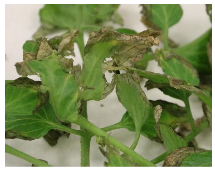
Figure 4. Tuta absoluta damage on tomato leaf axil

types have been expressed in previous study (Bayrambekov, 2019). At first glance, yellow spots on the leaves infected with the pest was appeared. But on closer inspection, it was understandable that it was dried epithelium after the parenchyma of the leaf axil eaten by the larva of the pest. As the number of larvae increases, so does the dried area of the leaf axil, which consists only of epithelium (Figure 2; 4).