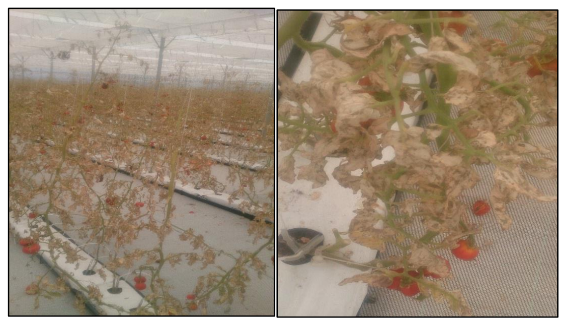
Figure 2. Tuta absoluta damage in the tomato greenhouse in case of high population

On the other hand, adults were active at night and hide in dense vegetation during the day. As a matter of fact, it was possible to see moths flying in the daytime if the plants were touched. In case of high population, the mass flight of adults during the day can be observed as well.