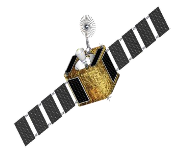
Fig. 2 Xplorer spacecraft

Deep Space Industries, or DSI, is a privately owned American company operating in the space technology and space exploration industries. Deep Space is the second company established to deal with asteroid mining. DSI develops and builds spacecraft technology that enables private companies and government agencies to access their destinations throughout the solar system. The stated goal of DSI is to democratize deep space access by fundamentally changing the deep space access paradigm and greatly reducing cost (<u>http://deepspaceindustries.com/</u>).