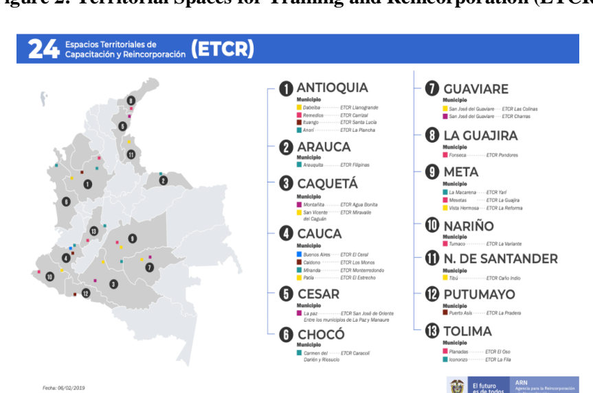
Figure 2: Territorial Spaces for Training and Reincorporation (ETCR)

The 24 transitional spaces for incorporating former FARC guerrillas have become permanent (see Figure 2). According to the agreement's schedule, these should be temporary grouping zones until all the ex-guerrillas arrived and the weapons were delivered, that is until the violent actions ended. In total, the agreement provided a 180-day time to group the personnel inside these sites; but the date could not be enough due to multiple difficulties and needed to be extended.