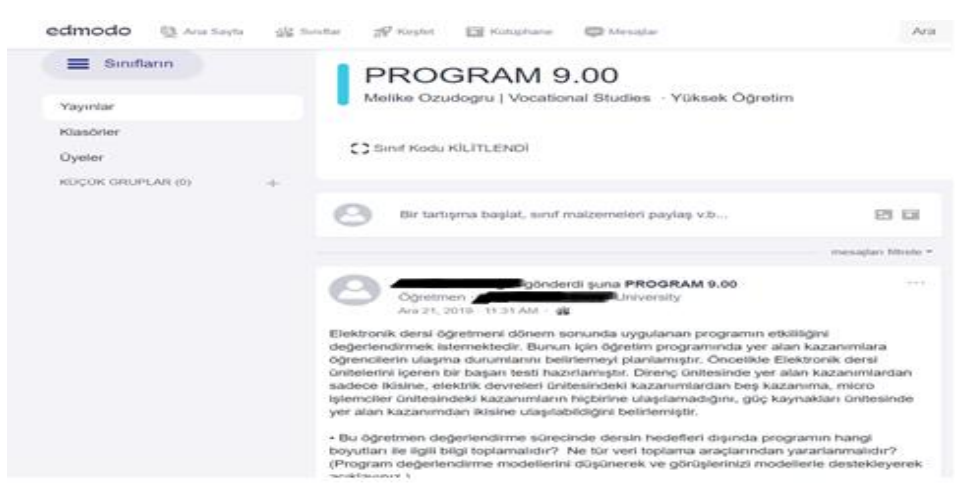
Figure 3. Asynchronous Edmodo discussions group

Out of class time, TC were expected to take part in asynchronous Edmodo discussions as shown in Figure 3. Some researchers stated that due to digital technologies, especially the existence of discussion forums, the behavioral engagement of learners has increased (Bond, et al., 2020). Also, behavioral and cognitive engagement of TC aimed to be enhanced through active learning opportunities which included asking thought-provoking questions during Edmodo discussions. Besides, Redmond et al. (2014) explained that discussing cases, open-ended questions, or problems was important to promote deep and meaningful learning in HL environments. Moreover, by designing a caring environment and providing TC with communication opportunities both among their peers and also with their instructor, an increase in emotional and agentic engagement was aimed.